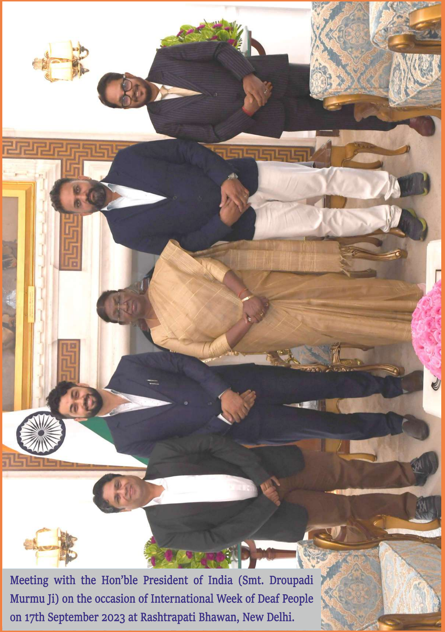
Meeting with the Hon'ble President of India (Smt. Droupadi Murmu Ji) on the occasion of International Week of Deaf People on 17th September 2023 at Rashtrapati Bhawan, New Delhi.